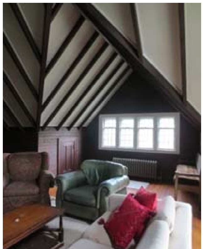
Pictured: Living Room on the 3d floor of the Rectory.